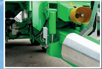
Hydraulic axle and drawbar suspension