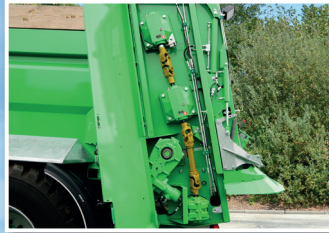
Driven by gearboxes and P.T.O.-shafts