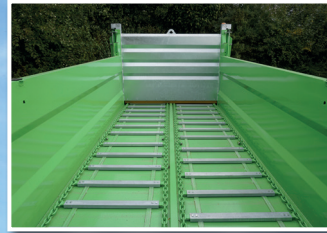
Double moving floor with bolted slats and shipping chains grade 80